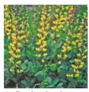
Baptista decadence 'Lemon Meringue'