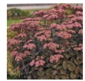
Sedum spectablis 'Maestro'

And don't forget the Perennial of The Year - Polygonatum odoratum variegatum, fragrant Solomon Seal Polygonatum odoratum 'Variegatum' is the Perennial Plant Association's 2013 Perennial Plant of the Year<sup>TM</sup>. Polygonatum odoratum, pronounced polig-o-nay'tum o-do-ray'tum vair-e-ah-gay'tum, carries the common names of variegated Solomon's Seal, striped Solomon's Seal, fragrant Solomon's Seal and variegated fragrant Solomon's Seal. This all-season perennial has greenish-white flowers in late spring and variegated foliage throughout the growing season. The foliage turns yellow in the fall and grows well in moist soil in partial to full shade