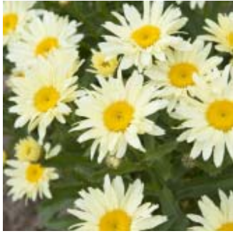
Leucanthemum Shasta Daisy 'Banana Cream'