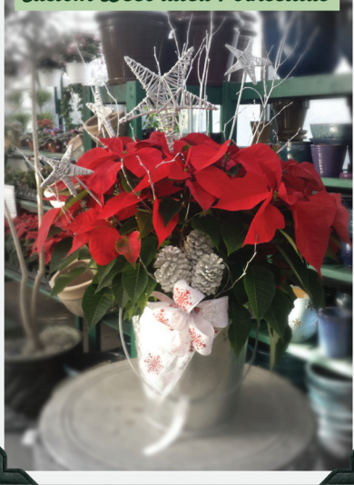
Custom Decorated Poinsettias