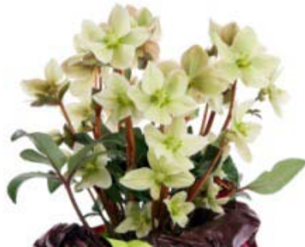
Helleborus Winter Rose