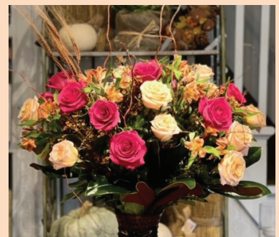
Elegance Rose Arrangement