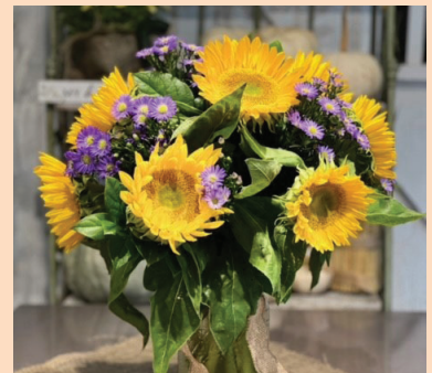
Smiling Sunflower Bouquet