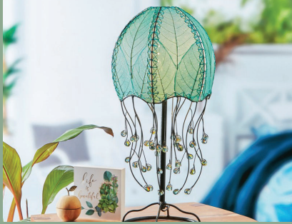
Fair Trade Winds Jellyfish Table Leaf Lamp