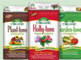
ESPOMA GARDEN FERTILIZERS